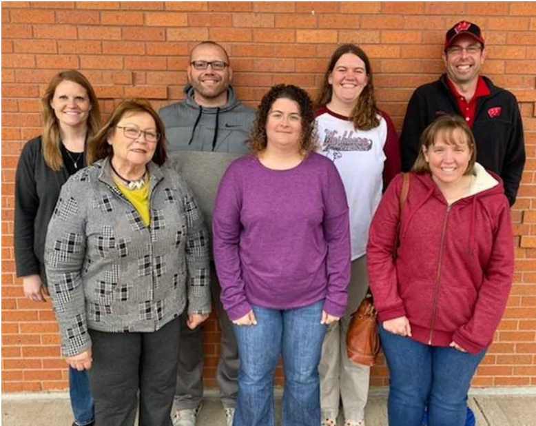
Just a few of our AMAZING teacher crew from 2020-2021.